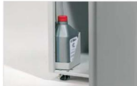
INTEGRATED AUTOMATIC OILING SYSTEM

EPC Electronic Power control: shows the shredding load required to optimize shredding without jams.