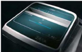
TOUCH SCREEN PANEL WITH LED INDICATORS

Just touch the controls to activate the machine functions.