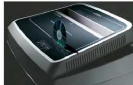
CD/DVD CUTTING UNIT AND TWO SEPARATE SETS OF CUTTING KNIVES

The Automatic Oiler eliminates the need to manually lubricate the unit. It protect the blades with anti-corrosive agents and ensures maximum reliability.